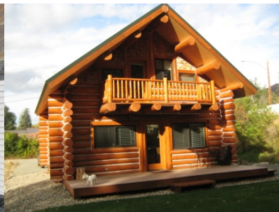
Twisp is a friendly little artistic, tasty organic town with modest sustainable homes, like Sandy & Coleen built next to the Twisp River where 13 eagles showed up recently.